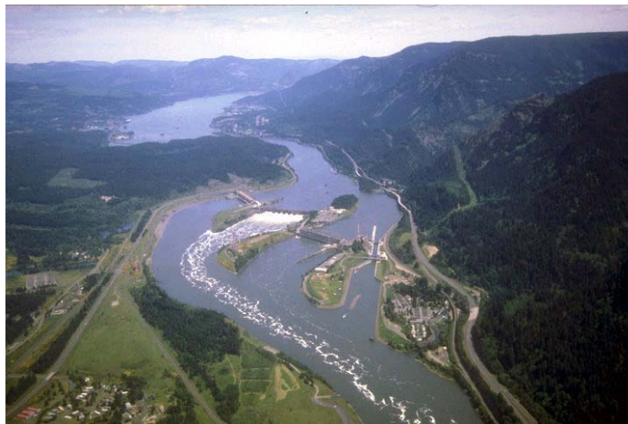
Aerial View of the Bonneville Dam